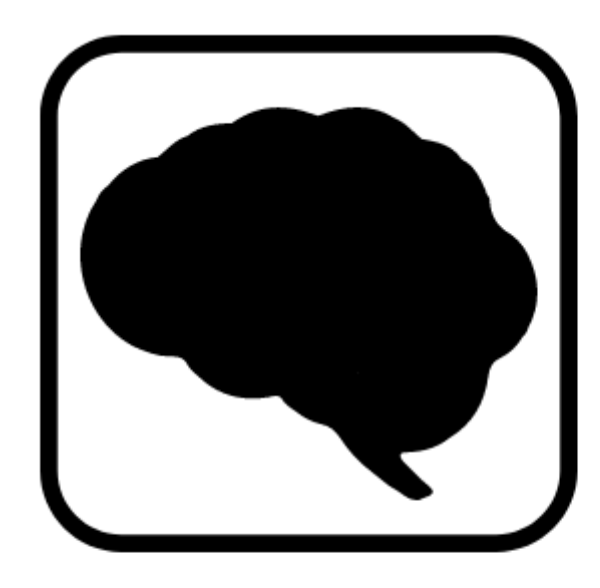
Theory of Change