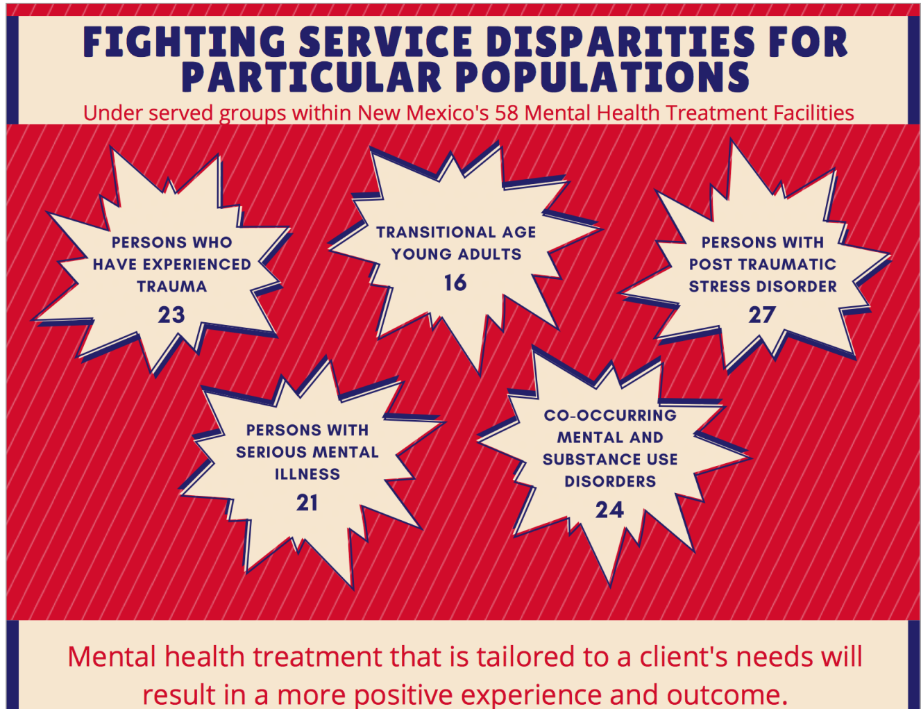
Figure 4.

Particular populations are more at risk than others for negative health outcomes. It is important to have tailored interventions that meet the needs of these vulnerable populations. Figure 4 outlines those vulnerable populations and shows how many facilities in the state of New Mexico have programs designed to meet their individual needs. With the high prevalence of substance abuse with mental illness in the state it is unfortunate that only about half of the mental health treatment facilities offer programs specifically for co-occurring substance abuse and mental disorders.