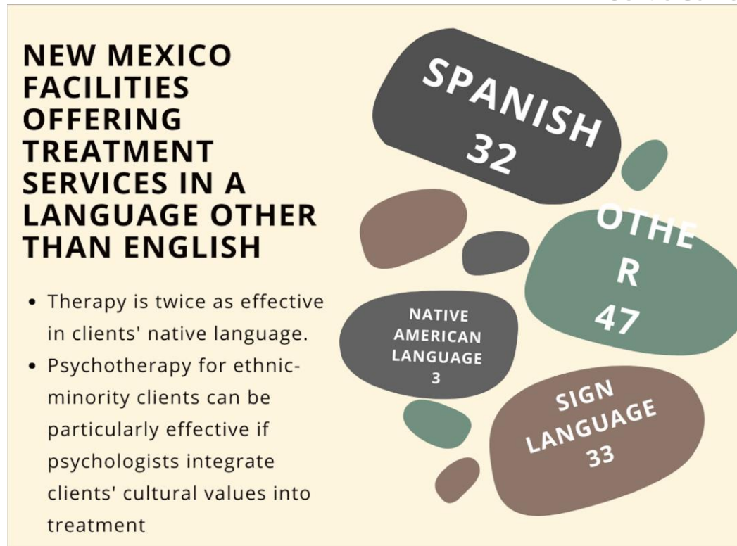
Figure 1. Source: National Mental Health Services Survey (N-MHSS): 2018, Data on Mental Health Treatment Facilities.

According to the 2018 (N-MHSS), out of 58 total mental health facilities in New Mexico, a state with a population of over 2 million residents, only 32 of those facilities offer treatment services in Spanish. (see figure 1). As cited in the literature review therapy provided in a client’s native language is twice as effective than when provided in English only. New Mexico is a Hispanic majority state, with an increasing number of immigrants from Central and South America. This is problematic for clients who wish to receive services in their preferred language. Additionally, language is but one factor within a culturally appropriate care model and additional cultural considerations, such as social, economic, and immigration status, need to be made.