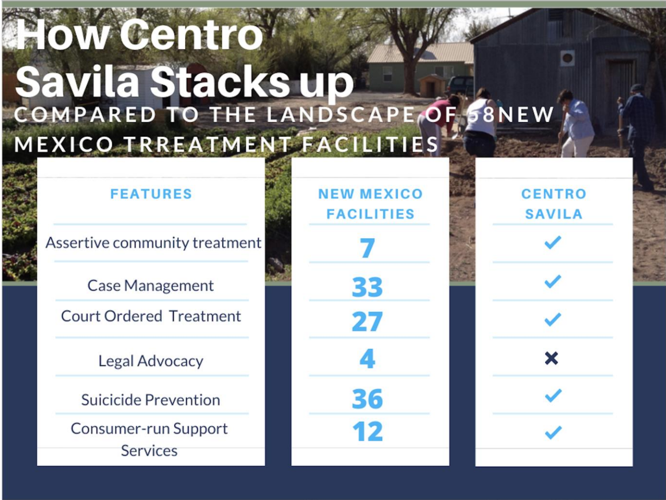
Figure 5.